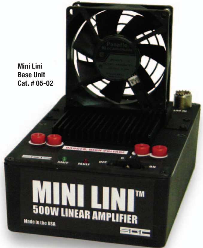
Mini Lini Base Unit Cat. # 05-02