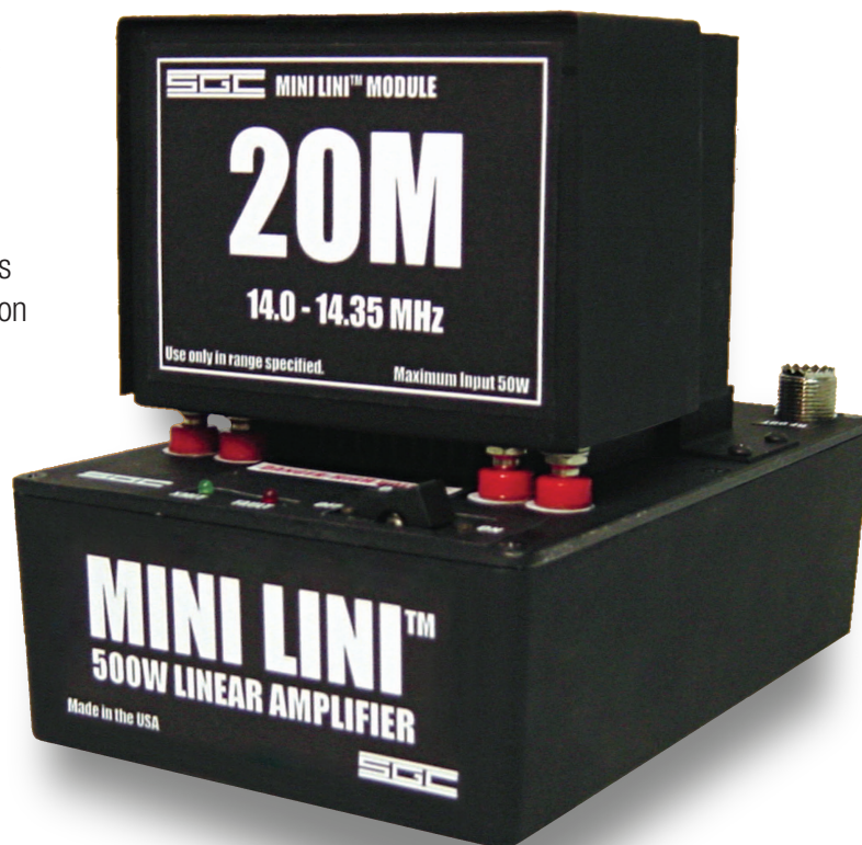
Mini Lini Package with 20M Module Cat. # 05-01

The MINI LINI uses class E technology that is capable of efficiency close to 90%. The high efficiency offers many advantages; in fact, the heat produced is less than 1/6 that of a conventional linear amplifier at the same output power. And, AC power consumption is about 1/3 less than a conventional amplifier. This means that the MINI LINI will work well on any normal 120 VAC outlet.